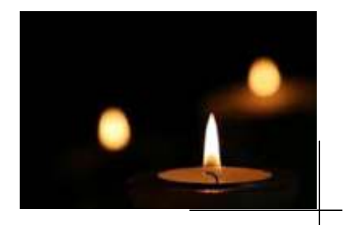
Suffering is a bell ringing inside, warning people that they are playing too far from home